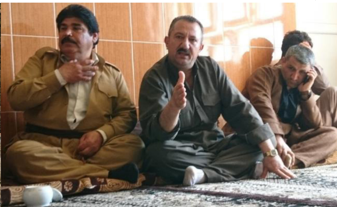
The father of one of the bombing victims telling CPTers about his son.

anger and sadness, she told CPT that no one is stopping Turkey from killing Kurdish people.