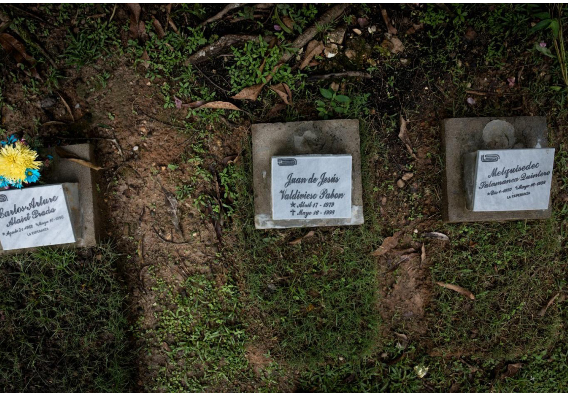
The diocese of Barrancabermeja provided the families of the victims' burial plots, at the Garden of Silence cemetery, where eight of the returned remains are buried.