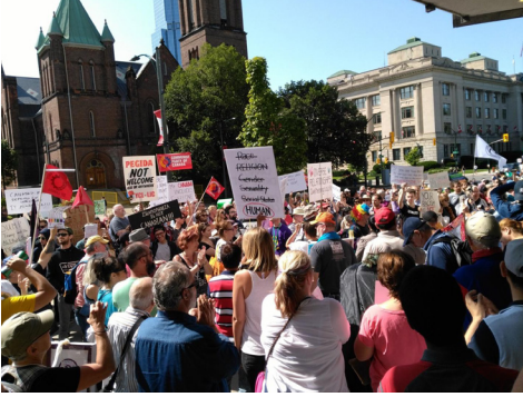
CPT Canada marshals a counter-protest in London, ON, August 2017.