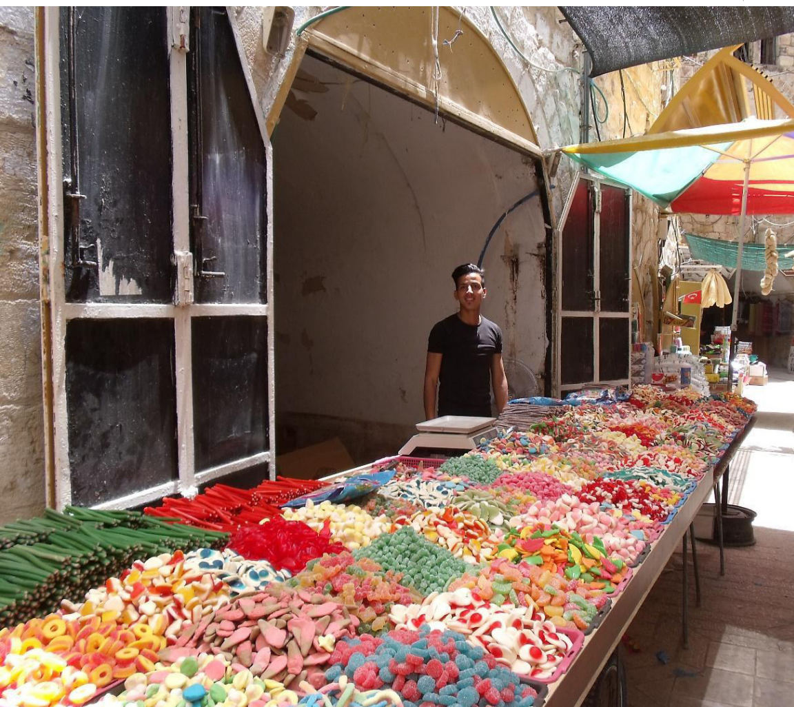
A vendor in the Souk offers a wide array of colorful sweets for Ramadan.

women and children who flock to the Ibrahimi Mosque, especially on Fridays for the noon prayer.