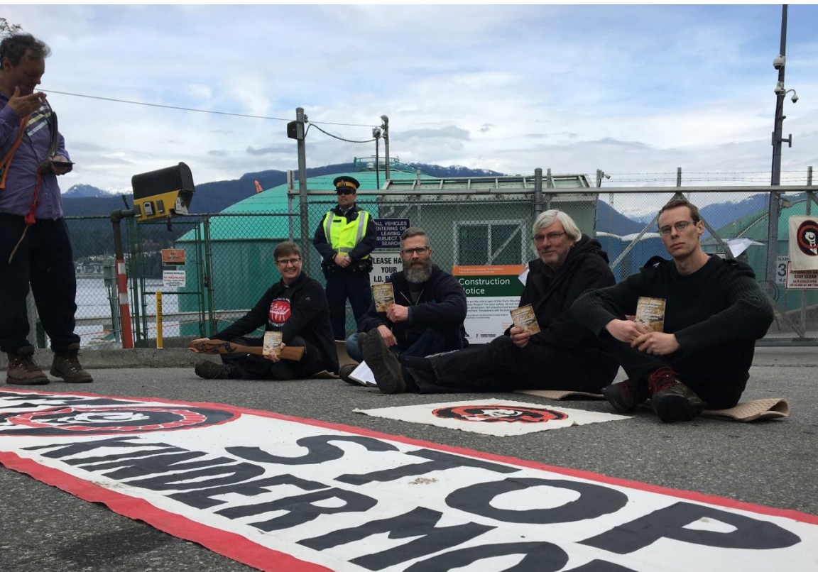
Participants sit in the midst of a protest against the Kinder Morgan Trans Mountain Pipeline.