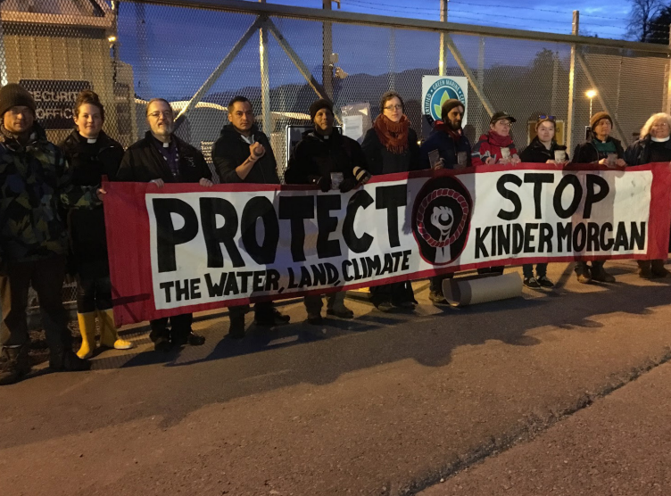
Pictured: CPTers and partners at a protest against the Kinder Morgan Trans Mountain Pipeline.