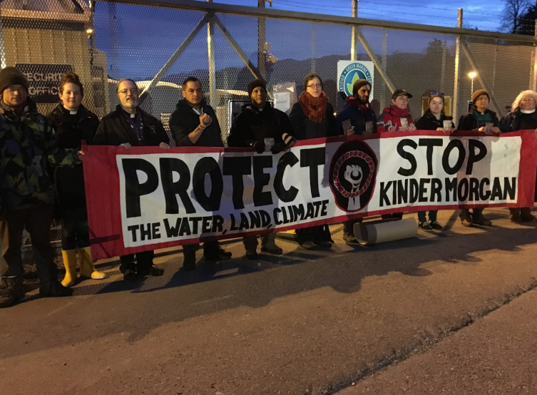
Pictured: CPTers and partners at a protest against the Kinder Morgan Trans Mountain Pipeline.

Non-profit Organization U.S. Postage PAID Chicago, IL Permit #7845