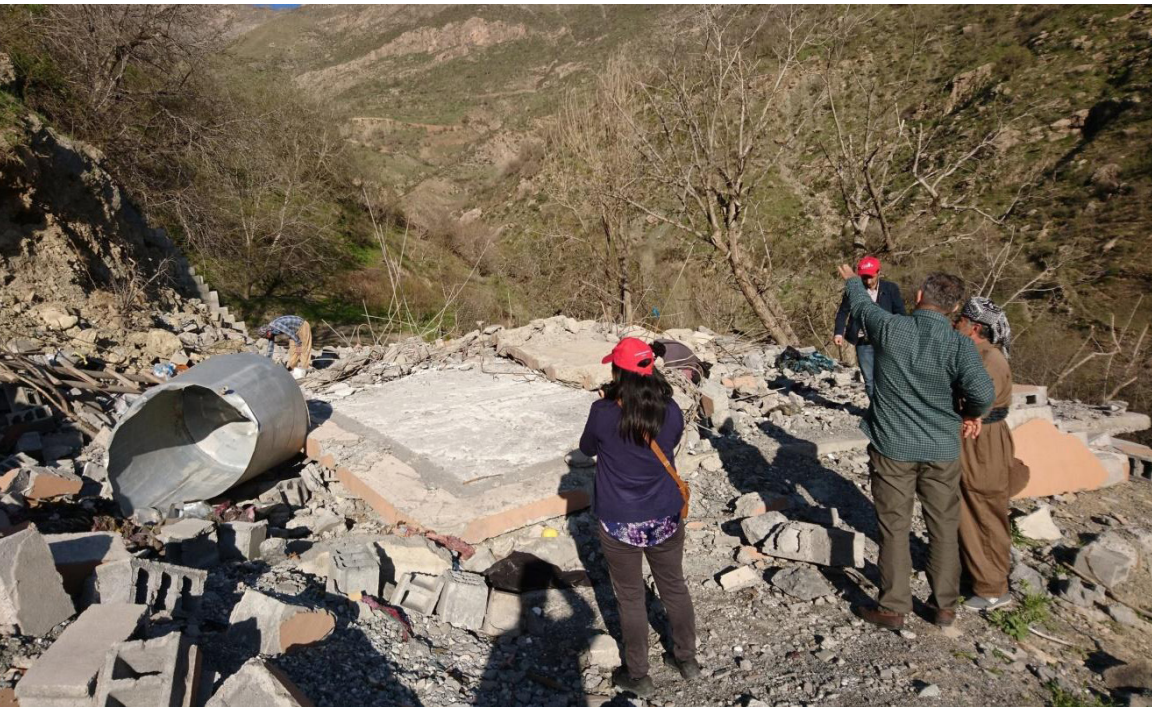
A villager from Sarkan telling CPTers about the bombing by the Turkish warplanes.