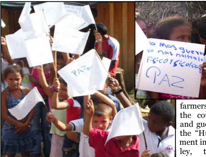
Children from Micoahumado walk for peace during the visit of a Human Rights commission. "No more war. No more physical and psychological mistreatment. We want PEACE!"

a continuing presence since February 2001