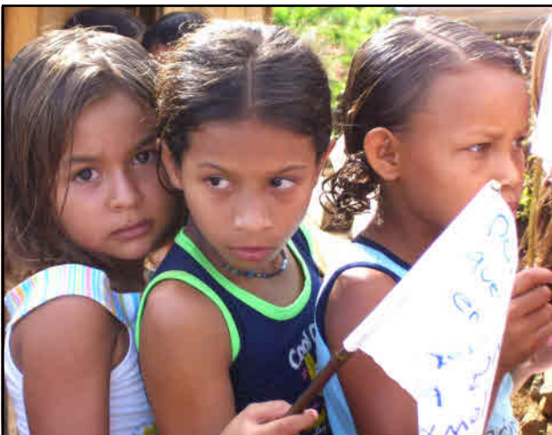
Colombian children march for peace.

Christian Peacemaker Teams - Canada 25 Cecil St., Unit 307 Toronto, ON M5T 1N1