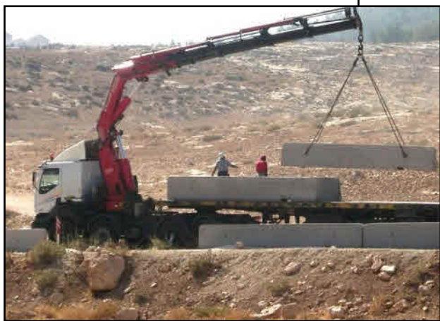
Workers dismantle the short "security wall" section by section, restoring access to vital areas of the South Hebron Hills.