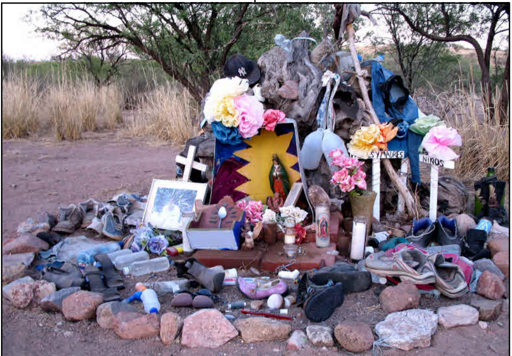
Memorial composed of items discarded by migrants in the Arizona desert.

In Arizona, CPT Borderlands work continued on a small scale through the part-time commitment of one Tucson-based CPT Reservist who organized and hosted two delegations and maintained CPT's important relationships with key Arizona partner groups. A December consultation in Douglas, Arizona between CPT and partner groups called for CPT to work toward a year-round Borderlands team in late 2008 based in Douglas and focused both on local issues and on wider national Borderlands issues.