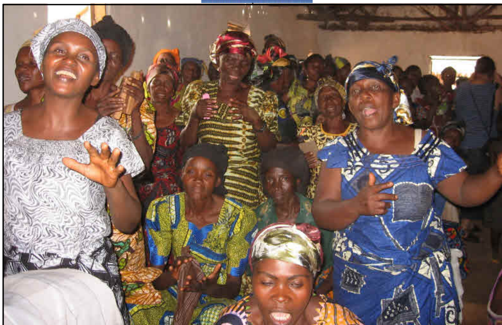
Congolese women, many of them victims of rape by armed groups, demonstrate spiritual resistance and work toward healing.