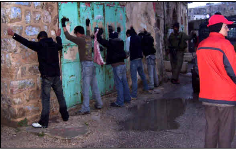
Israeli soldiers arbitrarily detained six Palestinian teenagers in Hebron for three hours. The youth were arrested and released at midnight.

plies to protest Israel's attacks and blockade of Gaza.