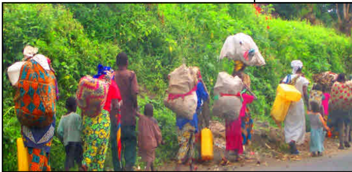
Displaced Congolese flee renewed fighting.

people have died from war-related causes in the DRC since 1998 – the world's deadliest documented conflict since WW II. The CPT team met with a variety of welcoming human rights groups in the region and recommends that CPT establish a presence there as personnel and finances allow.