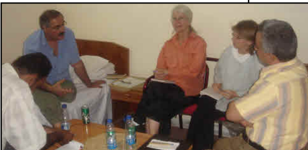
CPTers meet with members of Muslim Peacemaker Teams (MPT) in Suleimaniya.