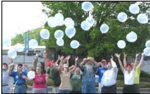
Standing before a major U.S. production facility for DU weapons, 15 CPT delegates released over 400 helium balloons to illustrate that "we are all downwind" of toxic DU.

The Northern Indiana Regional Group's ongoing campaign to end the production of depleted uranium (DU) weapons included 2 delegations to production facilities and networking which has increased international visibility of the issue.