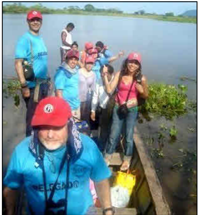
Colombian participants in CPT's advent delegation visit communities along the Opon River.

wagong (Grassy Narrows, Ontario) in August, and two to Algonquin Territory in Eastern Ontario in November and January.