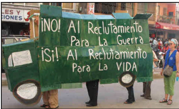
CPT delegation members created a "counter-recruitment" truck in support of Colombian conscientious objectors. "No to recruitment for war. Yes to recruitment for Life!"