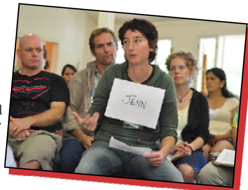
Group role play during seminar.

In February 2010, racialized CPTers met for five days in Colombia to deepen the transformational work of undoing racism in CPT. The group established the Race Relations Council which has representation on CPT's Steering Committee.