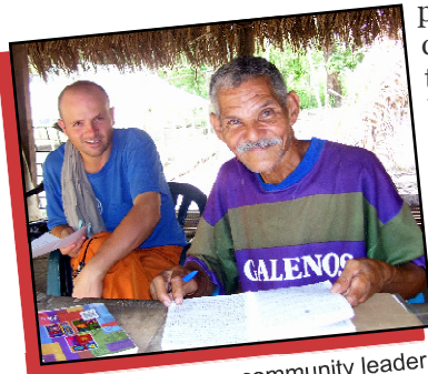
CPT visits Las Pavas community leader

Based in the city of Barrancabermeja, CPT accompanies communities facing threats to their land, livelihood and cultural identity in the central Magdalena River valley of north-central Colombia. In partnership with subsistence farmers, artisan miners, social change organizations, displaced persons, indigenous communities, and conscientious objectors, team members support grassroots initiatives to expose and transform structures of domination and oppression through active nonviolence in order to make possible the reign of God – a world grounded in respect, justice and love, even of enemies.