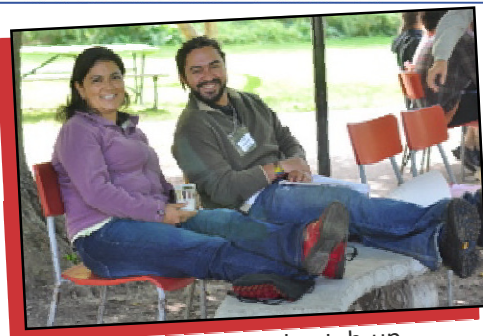
CPTers relax and catch up between workshop sessions.

In August 2010, Corps members gathered for a 2-day Undoing Oppressions seminar focused on the intersections of racism, sexism and heterosexism, followed by a 4-day biennial retreat in Ontario, Canada.