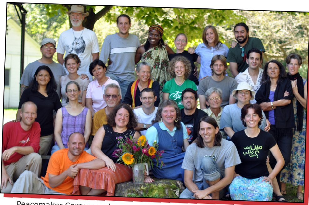
Peacemaker Corps members present at biennial retreat in Ontario, Canada August 2010