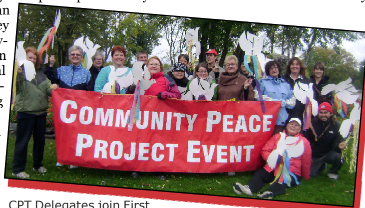
CPT Delegates join First Nations communities in a public peace walk.

In this 9-month fiscal year, 85 people participated in 10 CPT delegations.