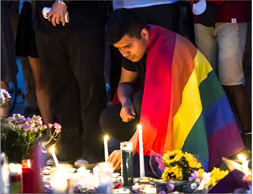
An unidentified man, wrapped in a rainbow flag, lights a candle during a vigil.