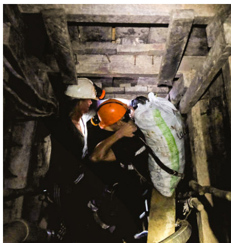
Two miners rest on the climb out of a 300 meter deep mine. They carry 90 kgs of rock on their backs which are broken down for gold extraction.

The delegation experience was very enriching and allowed our group to become more knowledgeable and aware about the armed conflict happening in our country. We will continue to reflect