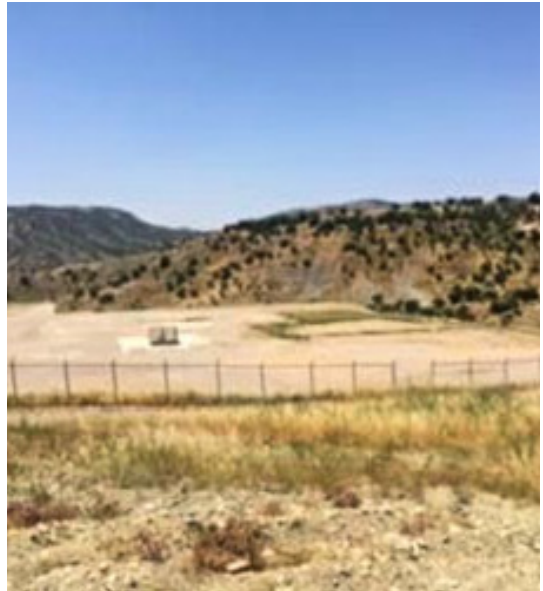
Oil containers on Iraqi-Kurdistan village lands.

We must change our own habits and policies of consumption, but we must do this in conjunction with divestment in order to put the necessary pressure on these companies to leave the oil in the ground. The oil companies will only