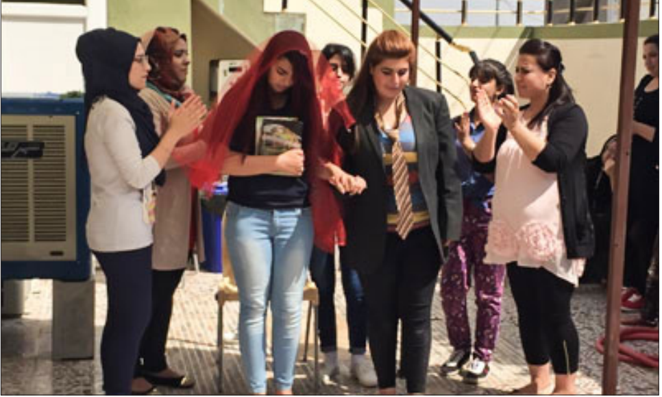
CPT Delegation visits the Baynjan Women's Center