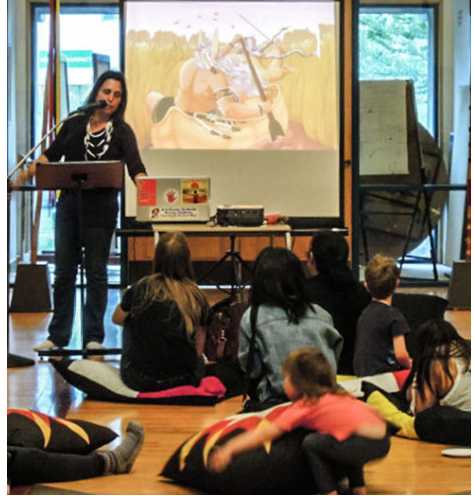
Red Rising #3 launch at Thunderbird House.