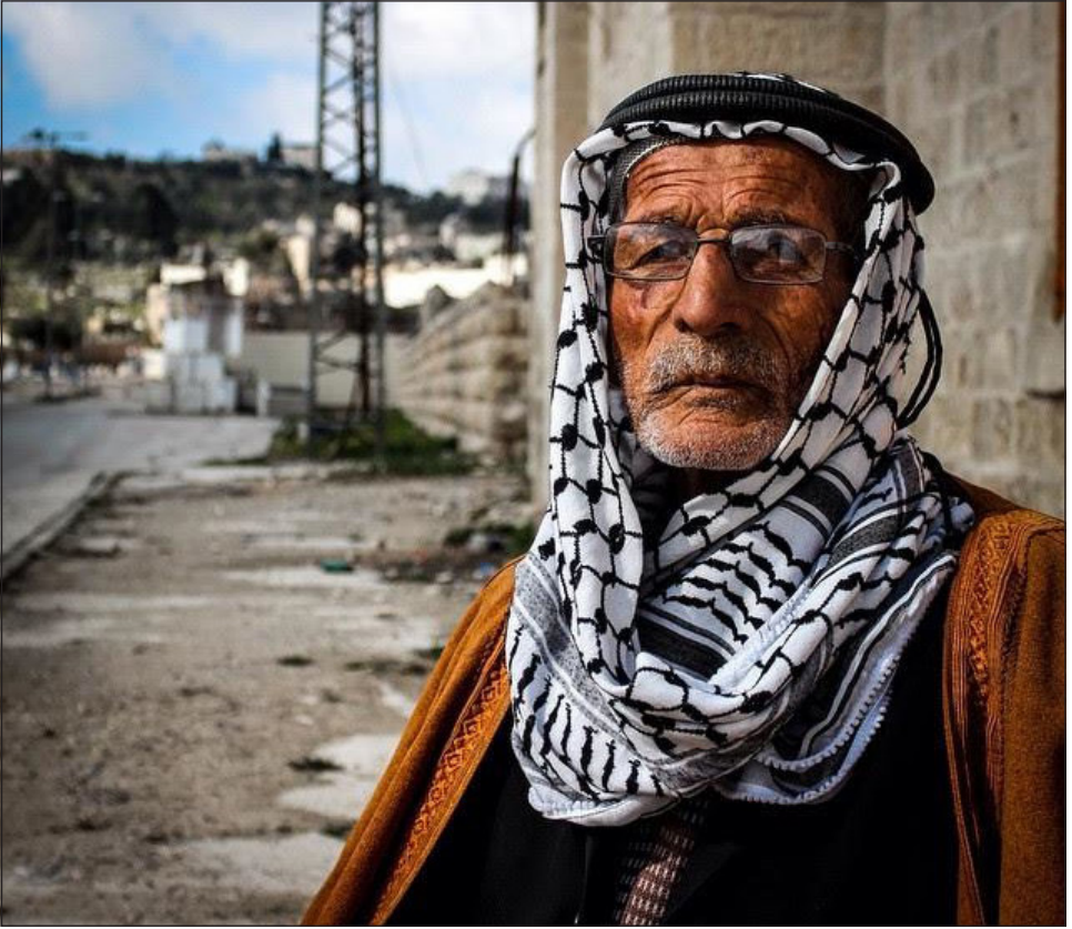
Palestinian elders still remember “the Catastrophe”.