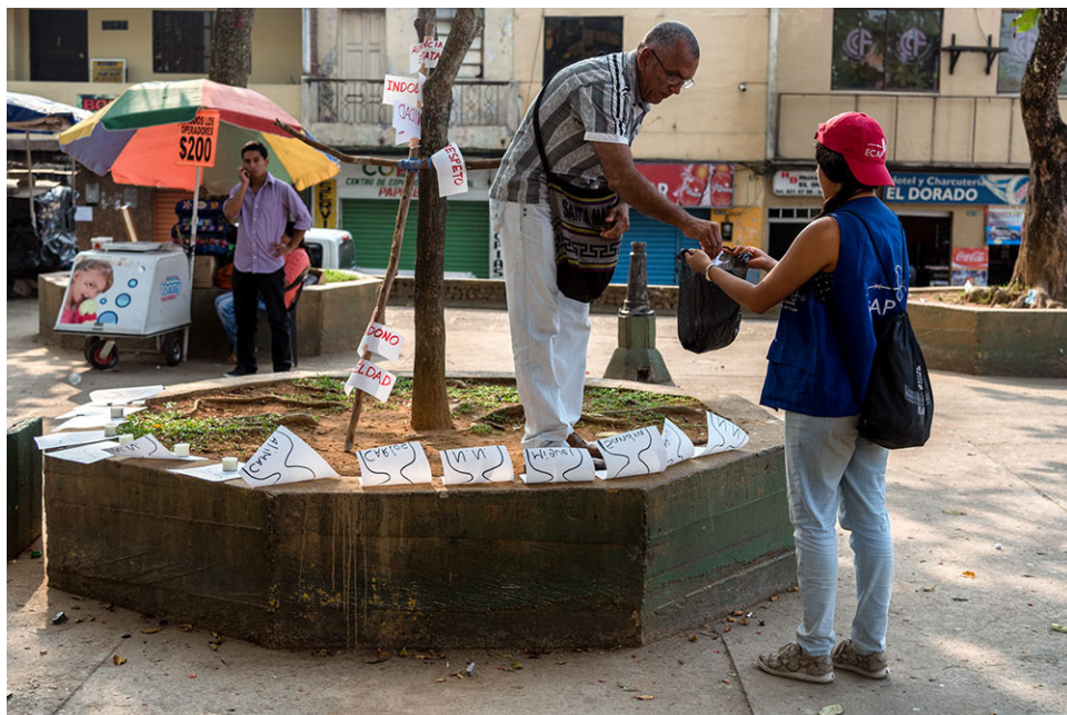
A local of Segovia participates in a public action organized by the delegation.