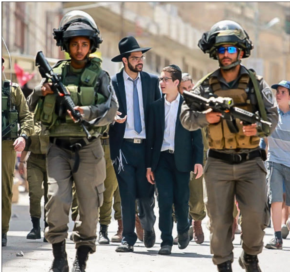
Israeli military and border police escort Jewish tourists through the H1 section of northern Hebron, shutting down Palestinian streets and shops.