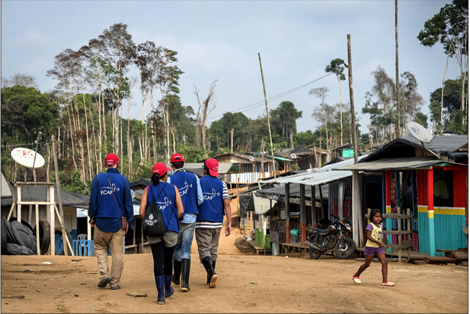
Delegates walk through the town of Mina Nueva, Antioquia.