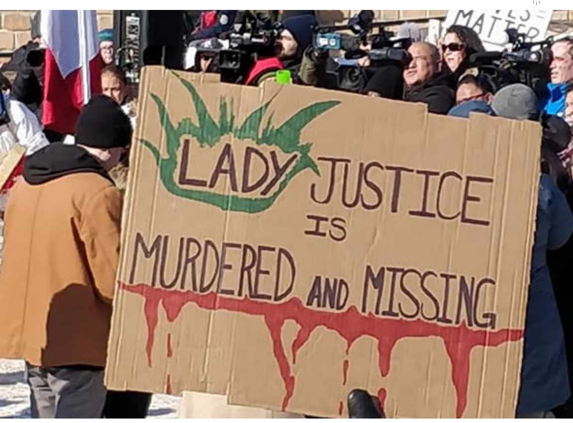
Community members in Winnipeg walk in honor of Tina Fontaine.

The attitudes and actions of colonization are alive and well.