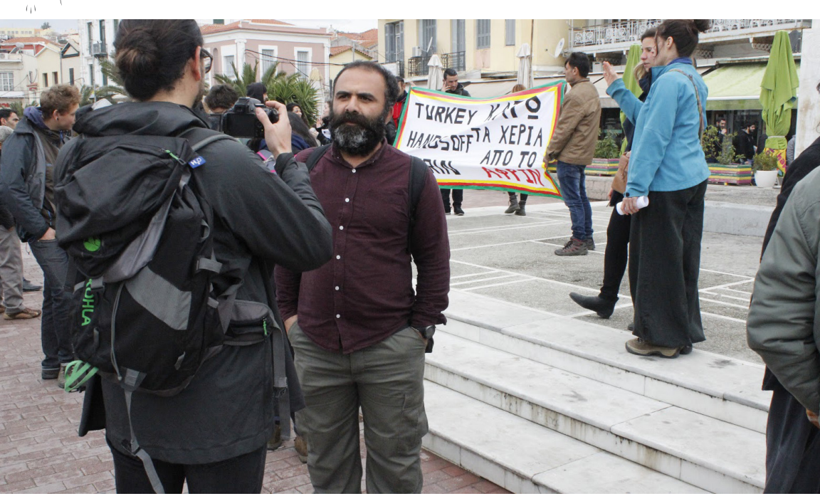
A CPT Lesvos Team member helps amplify the voices of the victimized Kurdish community members of Afrin, Syria.