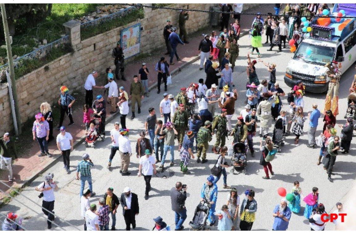
The settler parade causes disruptions in the daily routine of Palestinians.

about their everyday life. The arbitrary checkpoint closures are never announced, and Palestinians are completely stopped in their ability to move without prior warning. Students and teachers from Qurtuba school were detained on the stairs leading towards Shuhada Street, as they were trying to get home. Students and teachers at this school are only allowed to pass in the mornings on their way to school, and in the afternoon as they go home.