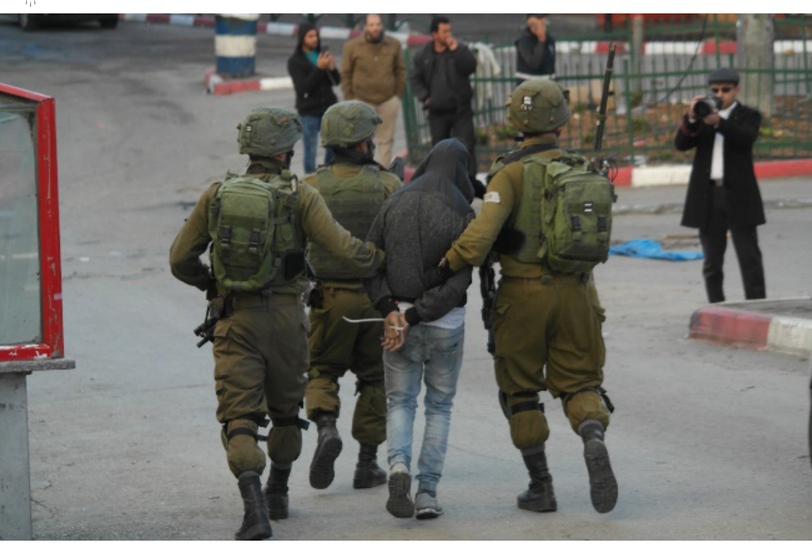
One of hundreds of Palestinians detained by the Israeli Occupation Forces in December, 2017.