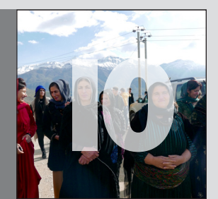
Villagers Show Solidarity to the People of Afrin, Syria