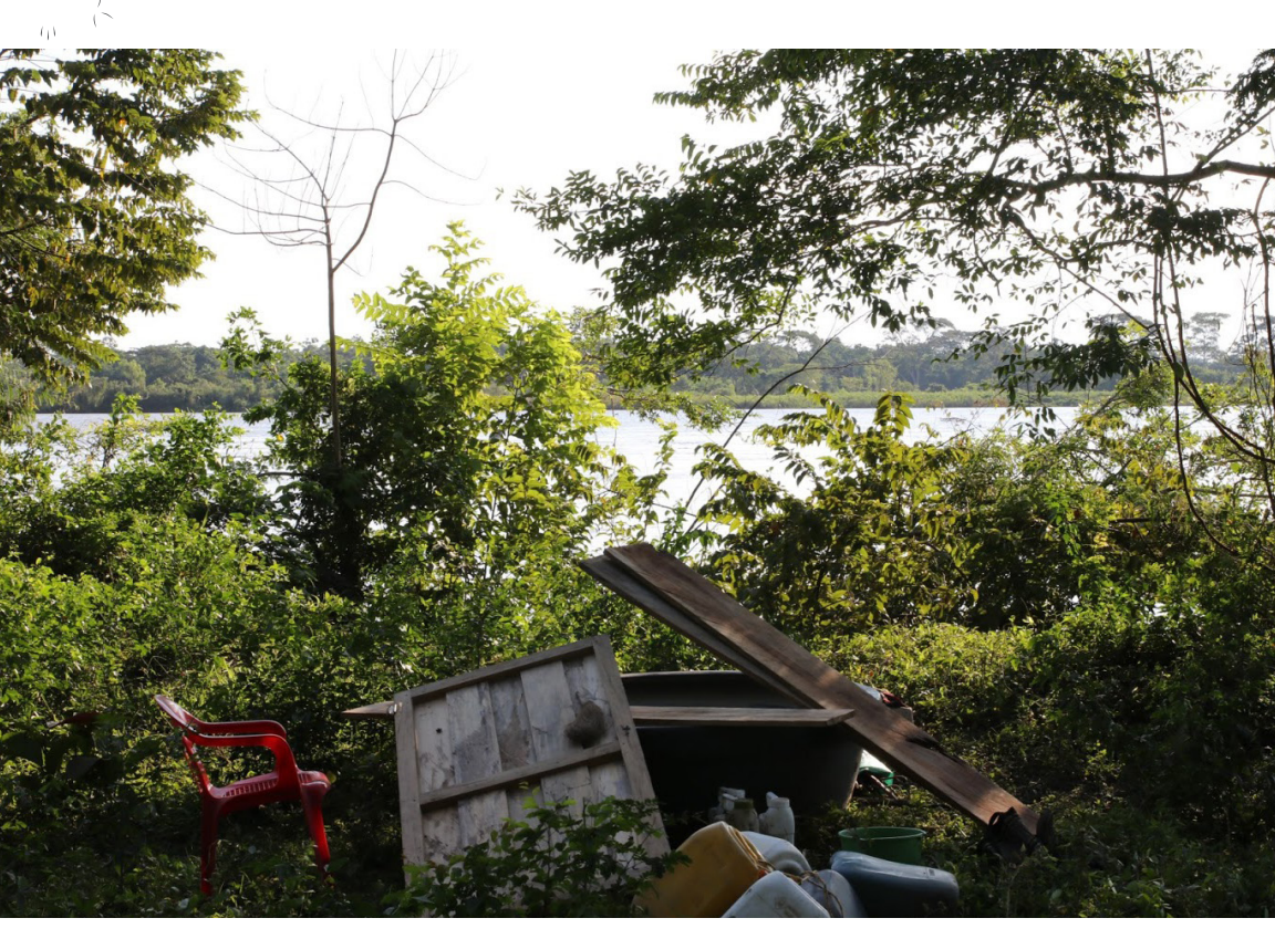
Community members' belongings are piled up beside the river after being evicted from their farms.

In the context following the new peace agreements signed by the Colombian government and the guerrilla group FARC, it is extremely alarming that a population recognized as victims, who should be protected and compensated, is instead being revictimized by the state. The first point in the agreements speaks of comprehensive rural reform to ensure land for peasant farmer campesinxs. This eviction is one of many examples where the state continues to give priority to large landowners who have never lived or worked on the lands they claim. In addition, part of the land in question is state land, and only the ANT can take legal action over these lands. The ANT has a duty to enter the region and clarify the boundaries of state lands, as it not a judge's jurisdiction to preside over cases involving state lands.