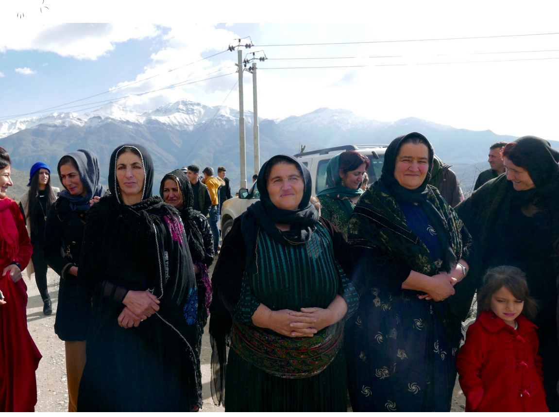
Women of Basta and neighboring villages in Iraqi Kurdistan gather in solidarity for the Kurdish town of Afrin, Syria, which is under attack from the Turkish government.